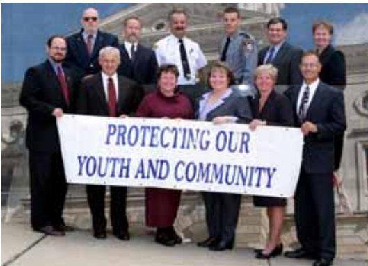
Partners in Community Awareness Day

Armstrong County held its third annual Community Awareness Day on January 9, 2006. Community Awareness Day is a comprehensive community-based effort to raise awareness on drug and alcohol prevention and treatment, domestic violence, sexual assault, and child abuse as well as inform the community of the resources available to those in need.