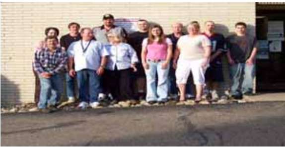
Drug and Alcohol Advocacy Group Celebrates One Year!

Truth: Research is showing the relaxed feeling that initially comes from having a drink can quickly be replaced by a heightened state of stress and anxiety. This is true for the social drinker as well. Leading organizations in the drug and alcohol field are urging people to find more effective ways to cope with stress and anxiety. Some alternatives to reduce stress without alcohol: 1) take 10-20 minutes to relax while listening to peaceful music or enjoying some relaxing scenery; 2) exercise regularly and eat healthier foods (particularly avoiding caffeine as evening and nighttime approaches); 3) find a trusted friend or counselor who can help you unload some of the emotional luggage you may be carrying; 4) and finally, learn to say no to things that are not in line with your life mission that will likely cause you to be more stressed.